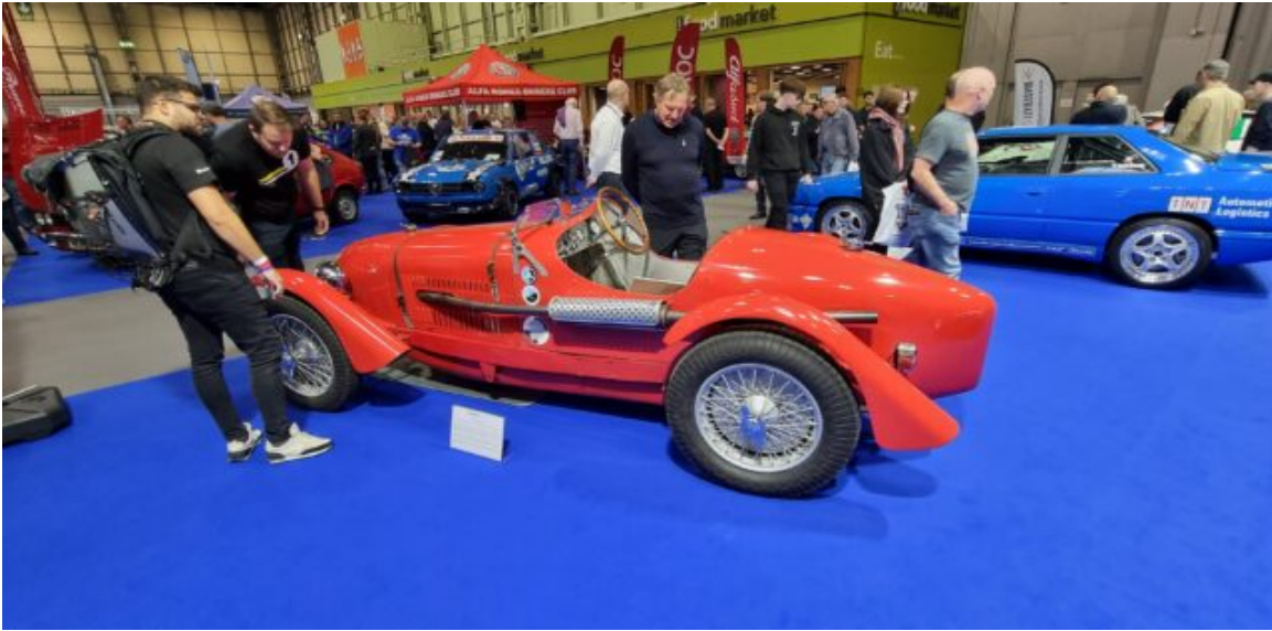
NEC Classic Car Show