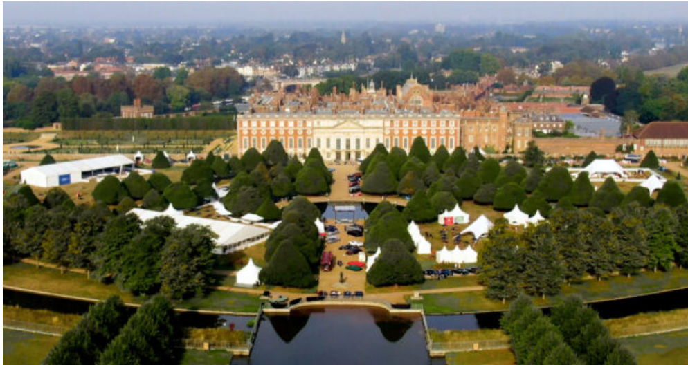
Hampton Court Salon Prive