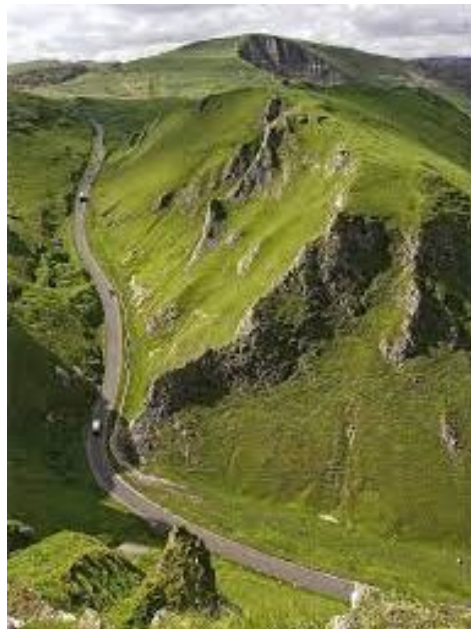
Peak District Autumn Rally