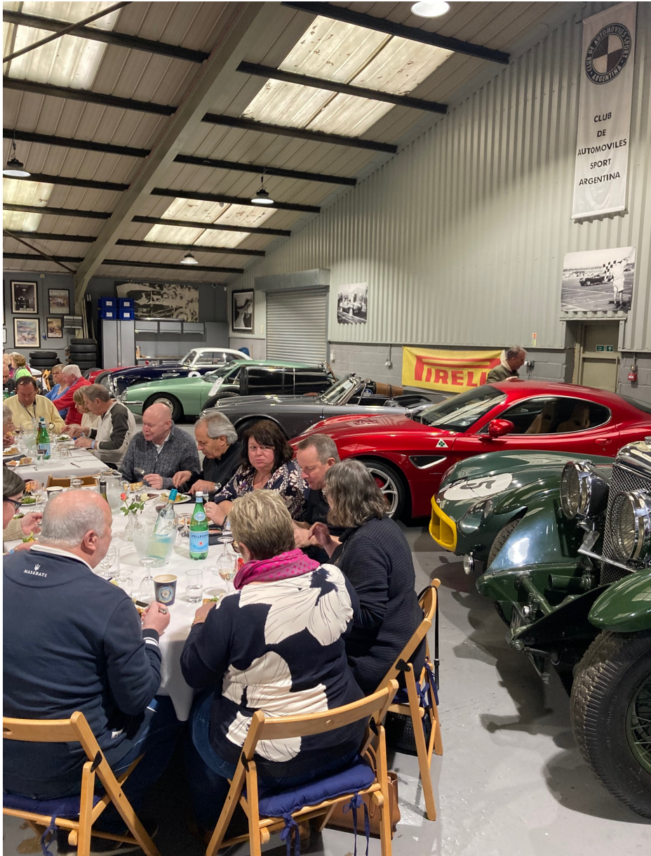
'a wonderful setting for lunch'