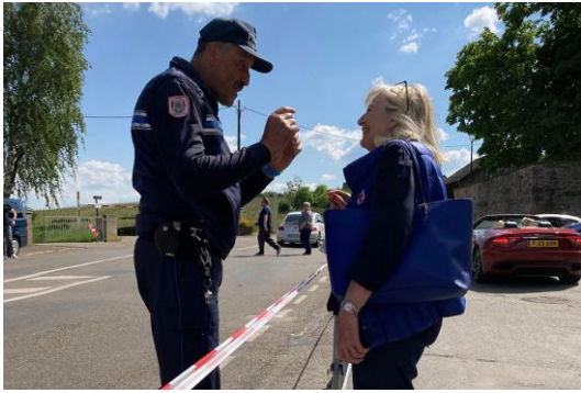
No speeding please