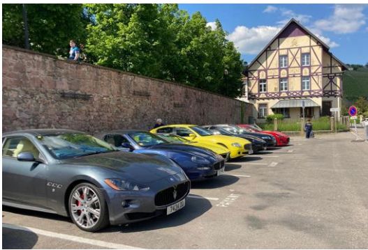
Lining up in Riquewihr