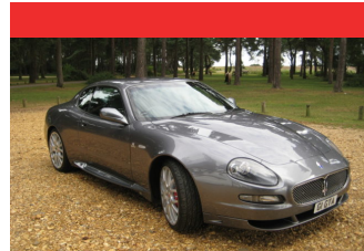
2005 MASERATI GRANSPORT 4200 £22,950.00 miturn@talktalk.net 02380 893 773