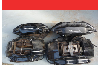
MASERATI 3200 BRAKE CALIPERS £300.00 mutlowgm1@gmail.com 07976 703 585