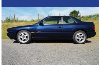
MASERATI 1997 Ghibli 11 Cup Price on request efj@manx.net 01624 822622