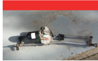
MASERATI WIPER MOTOR ASSEMBLY £75.00 mutlowgm1@gmail.com 07976 703 585

GHIBLI GT OWNERS MANUAL REQ'D £50.00 philmaserati@gmail.com 07802 535745