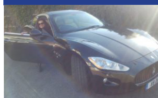
2006 MASERATI GranTurismo S/MC £24,750 cook@cbn.net.id 01252655492