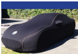
MASERATI Cover £150 4 GranTurismo MC Shift 20" Wheels £1000 nm.holmes@btinternet.com 07836 205300