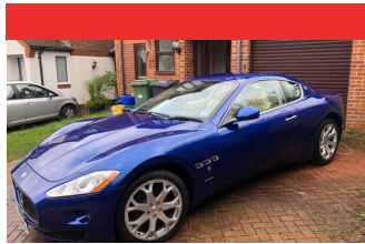
Maserati GranTurismo S/MC 2008 £22,500 marchantservices@gmail.com 01256 465542