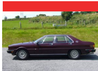
QUATTROPORTE 111 4900. 1984 14000 miles, 2 owners. £27,500. 01624 822622 ejf@manx.net