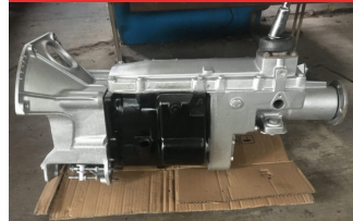
MASERATI ZF 55-325 GEARBOX From 1968 Ghibli AM15 $5,500 USD h.o@classicgarage.com.mx

ALL MASERATI MODELS CLASSIC OR MODERN> CALL DIRECT ON: 07787 528131