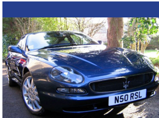
MASERATI 3200GT 6 Speed Only two owners. 57,000 miles. £16,500. 01433 670622