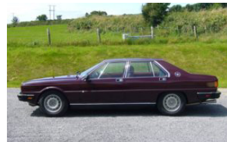
QUATTROPORTE 111 4900. 1984 14000 miles, 2 owners 01624 822622 ejf@manx.net