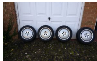
BITURBO WHEELS Bedfordshire. £200. 07837 374922