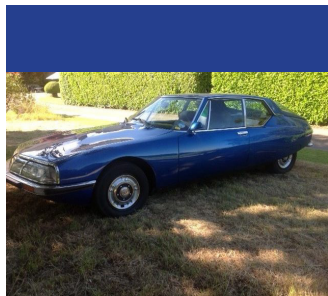
CITROEN SM 1972. 2670 L Reluctant sale. £35,000. 07807 718288