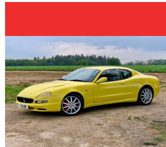
Maserati 3200GT Well known Club car. £19,995. andy@mcgrathmaserati.co.uk 01438 832161

WANTED! ALL MASERATI MODELS CLASSIC TO MODERN Barn finds to concours. Complete collections purchased.ww 07787 528131 sales@torosportscars.com