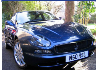
MASERATI 3200GT 6 Speed Superb example. Only two owners. 57,000 miles. £16,500. 01433 670622