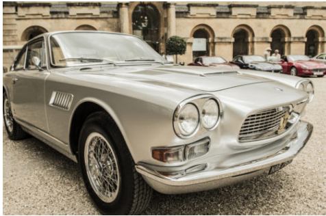
1966 Maserati Sebring Series 2