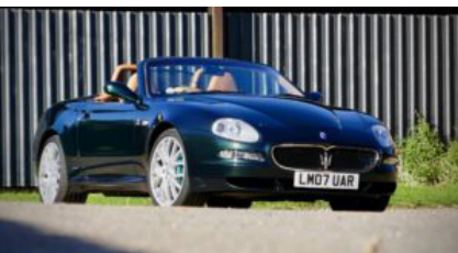
2007 GranSport Spyder

There were only ever 26 examples of the GranSport Spyder made in right hand drive and this is the final one. First registered in March 2007, it was ordered in Verde Goodwood with leather in Cuoio and beige. Factory options included Titanium brake callipers, Cruise control, rear parking sensors, heated memory seats and Xenon headlights. It also has the Windstop for extra comfort on long distances with the hood down. It was ordered through Meridien Modena by its first and only owner (a copy of the original purchase order is on file) and serviced by them when new. Latterly, servicing has been carried out by McGrath Maserati. The car has continuous and fastidious service history including a clutch change at 28,000 miles. It has now covered 39,000 miles. It has been magazine-featured in Auto Italia (copy of the magazine in file) and at times in the Trident. It is a well-known car in the Maserati Club and has been used on many club events and for touring on the continent. Now available to view at McGrath Maserati. Here is an opportunity to purchase probably the only single-owner example of one of the rarest Maseratis of its era. £45,000. Contact andy@mcgrathmaserati.co.uk 01438 832161