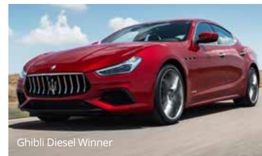
Ghibli Diesel Winner