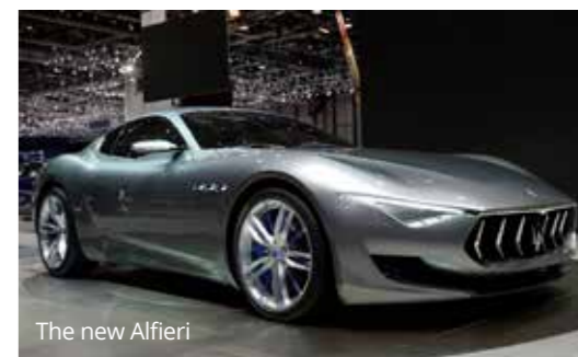
The new Alfieri