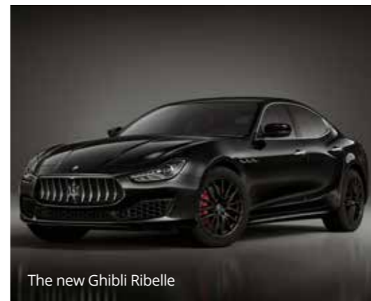
The new Ghibli Ribelle