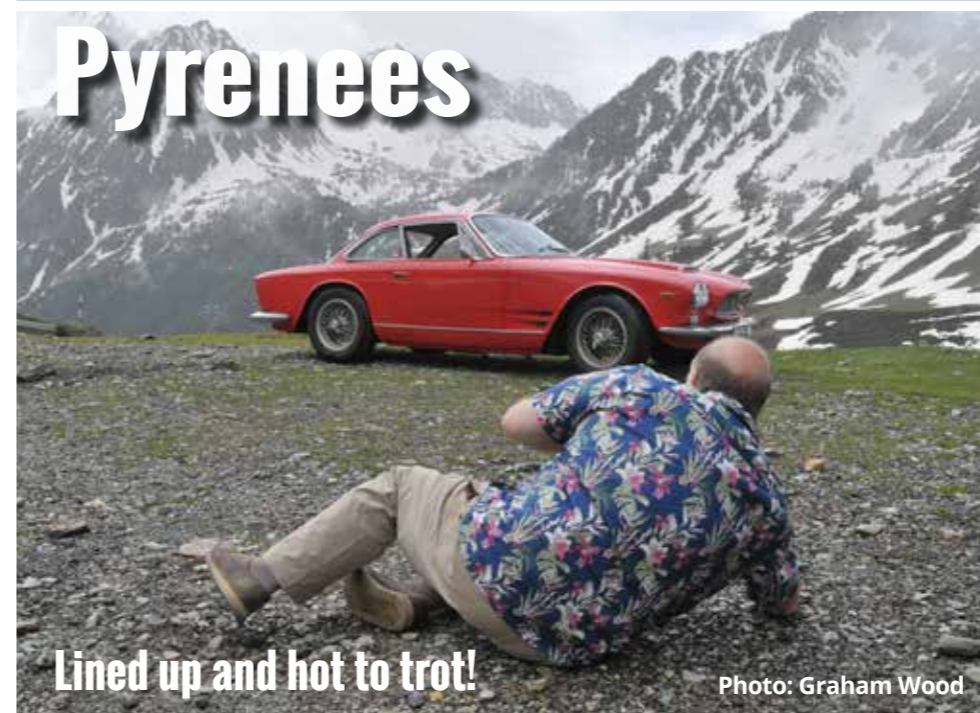
Lined up and hot to trot!