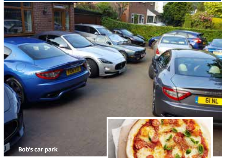
Bob's car park