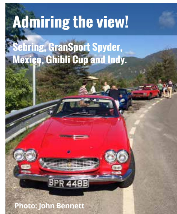
Admiring the view!

Sebring, GranSport Spyder, Mexico, Ghibli Cup and Indy.