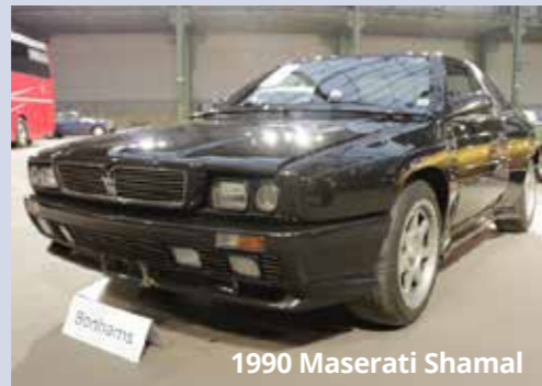
1990 Maserati Shamal

Neither the immaculate Bora with the American specification protruding rubber bumpers, or the well-presented 3500 Vignale Spyder reached their reserves. It may have been the post-it note with the starting instructions that put buyers off.