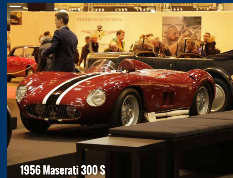
1956 Maserati 300 S