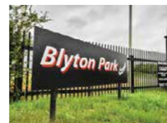
Welcome to Lincolnshire