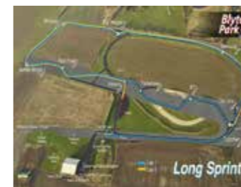
Our track layout. We will have two layouts to play on!