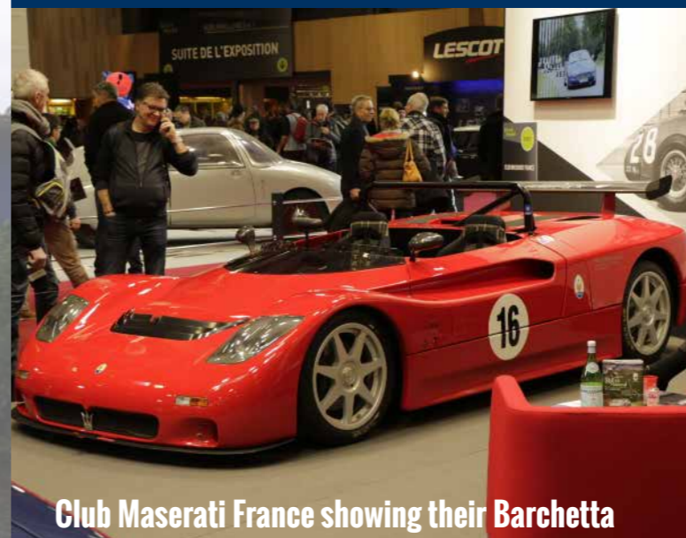
Club Maserati France showing their Barchetta