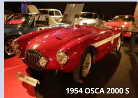
1954 OSCA 2000 S

1963 3500GT Spyder by Vignale, one of 250 factory produced with an estimate of £623,000 to £712,000, failed to sell. The colour scheme was black as per the original colour, only the interior