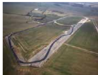
Aerial view of Blyton Park