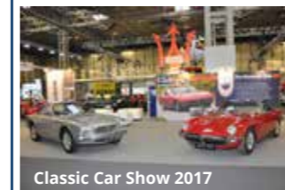
Classic Car Show 2017