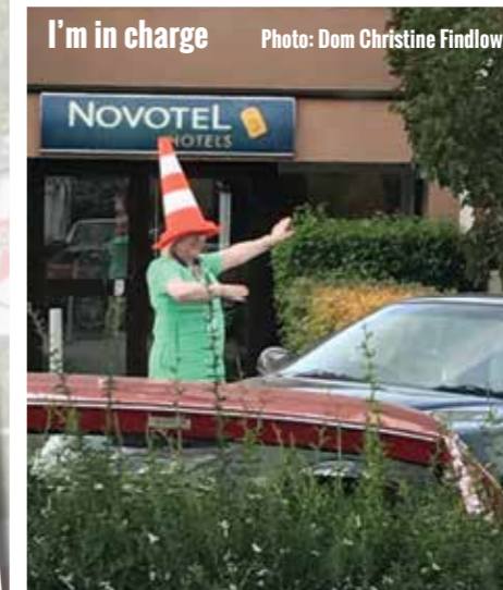
I'm in charge