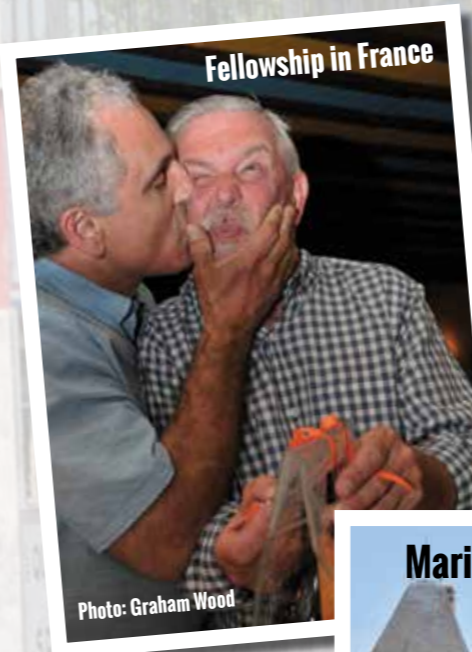
Fellowship in France