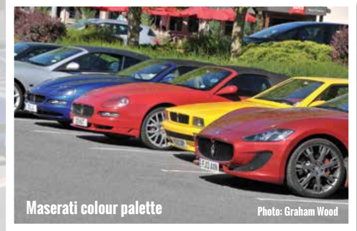
Maserati colour palette