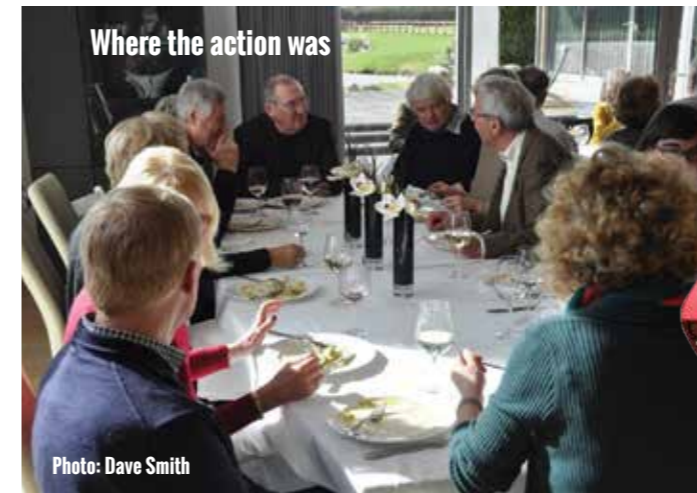
Where the action was