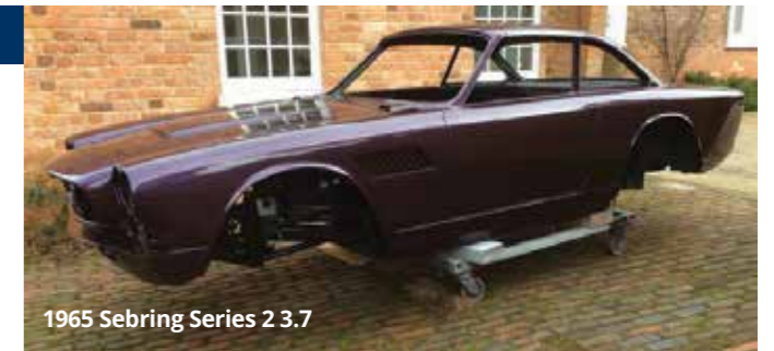
1965 Sebring Series 2 3.7

Call Greg Dyson 07980 681519 or greg@dysonholdings.com .