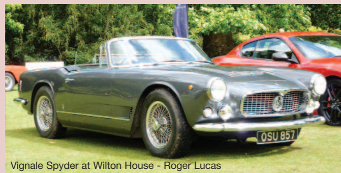
Vignale Spyder at Wilton House - Roger Lucas

The weather brightened during the day allowing us to look around the show including the Maserati Centenary display which had a good range of models including Indy, Mistral, Khamsin, Biturbo, Gransport, Granturismo, Grancabrio, QP 4 and 5 as well as the new QP6 and Ghibli. The main show contained some jewels that caught my eye including a lovely Lancia B20 GT and a fabulous Bristol 401 cabriolet. Apart from