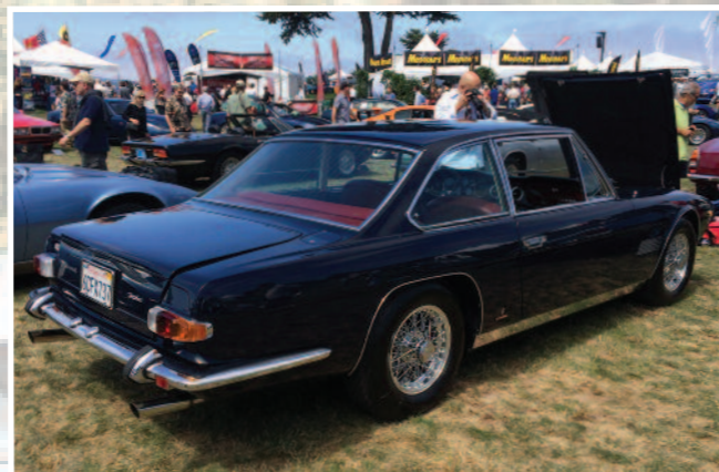
A Mexico in Monterey