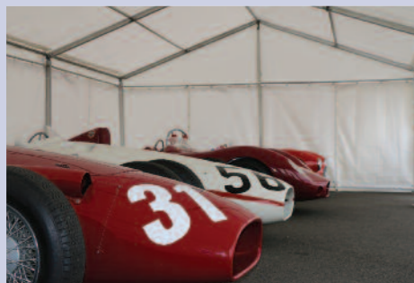
The Racing Maserati's and OSCA's