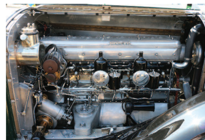
The Engine of straight eight Bentley from 1932 surely deserves a photograph even in a Maserati publication.