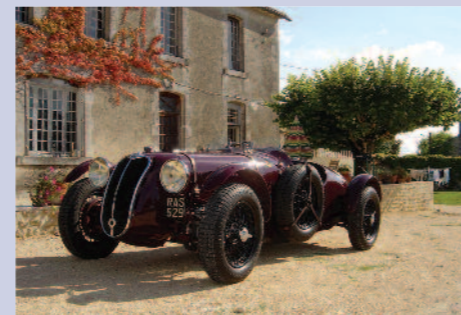
Model Tipo G4500 with 12 cylinders and 4500cc built in 1951