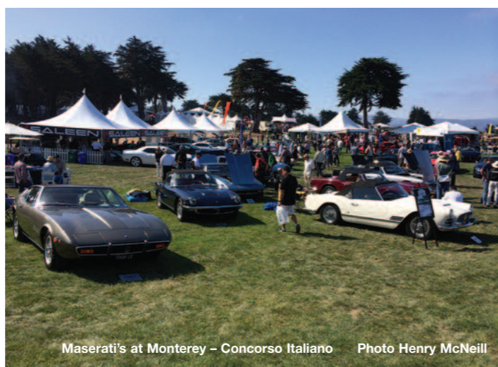
Maserati's at Monterey - Concorso Italiano

TICKET INFORMATION: No advance ticketing for this event, simply pay on the day. Adult £13, Seniors/Students £12, Children (5-16) £6.50 Family £4 Gates open 09.30. For more information, see www.brooklandsmuseum.com.