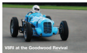
V8RI at the Goodwood Revival