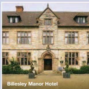
Billesley Manor Hotel

Price to be confirmed but should be about £600 per couple including bed, breakfast, lunches, dinners, canapés, champagne reception, wine at dinner only, and coffee at Bibury Court. Booking forms will be available later. Places will be limited, to register interest (no deposit required yet), please email douglas.lowndes@sky.com .