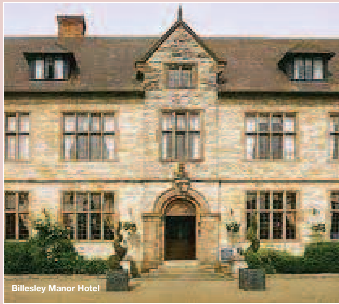
Billesley Manor Hotel

We will be meeting up on Friday at the prestigious Billesley Manor Hotel near Stratford-upon-Avon ( www.pumahotels.co.uk ).