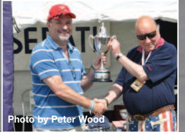
Fangio Trophy presentation

It started back in 1990 when I helped setup the club display in a marquee at the back of the Woodcote grandstand. We were then supported by the Maserati Concessionaires from Leeds with their Motorhome. Except for a couple of years, I have been involved with setting up the display for the club and arranging to get some very special Maseratis as centre pieces from generous club members. Over the years we have had differing locations, some on grass, some on tarmac and once around a pond after heavy rain had flooded the area!