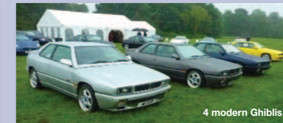
4 modern Ghiblis

I do not know what the future holds for the Club Concours except that after 10 years I shall not be involved. Perhaps there is need of a change of format. Even so, do not forget those who have so freely given us their time and expertise, they are just as important to the Club as our Members.