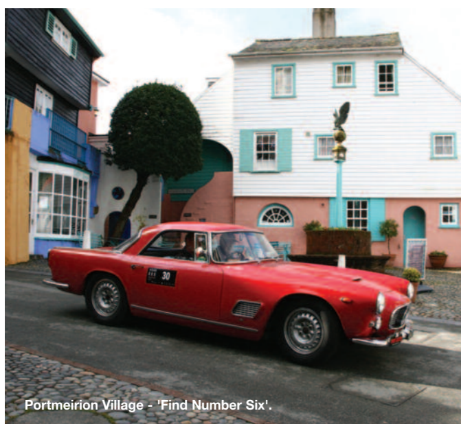
Portmeirion Village - 'Find Number Six'.

'CLOE', our faithful 3500GT Maserati rose to the occasion of the 10th Classic Welsh Trial to achieve 14th overall out of a field of 103 entries, 1st in Class and the Scrutineers Prize for the 'best presented entry'.