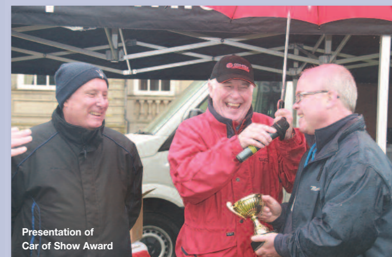
Presentation of Car of Show Award

This event along with the AGM the previous evening was my very last as a Committee Member and more recently as Vice-President.