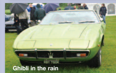
Ghibli in the rain