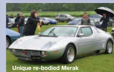
Unique re-bodied Merak