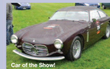
Car of the Show!