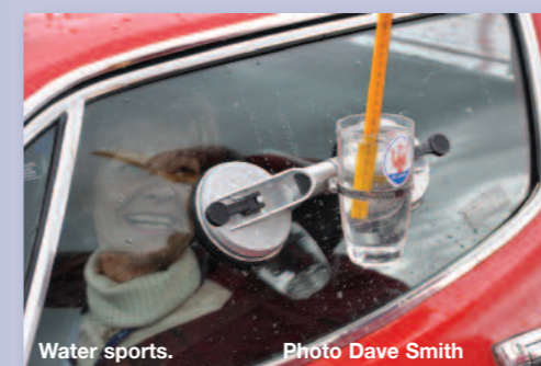
Water sports.