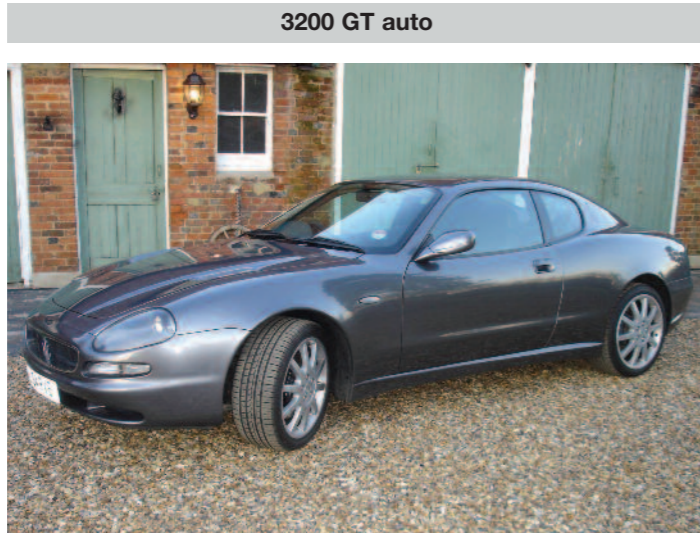
3200 GT auto

2003, silver/charcoal leather, 38,000 miles Cambio Corsa paddle shift, superb condition throughout, taxed and MOT, full history. A beautiful fast GT car. £13,999. Tel 01242 680130, andylerry@hotmail.co.uk