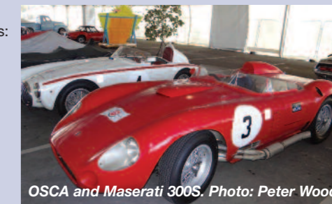
OSCA and Maserati 300S.