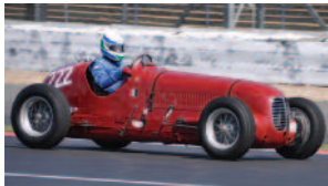
6CM, Silverstone Spring Start Meeting

Copies and enlargements are available at attractive prices. Contact Dave on 01494 717701