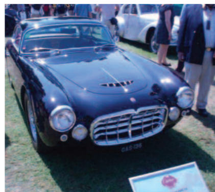
One of the few classics on display.

There were very few classic Maseratis to be seen at the Festival of Speed but the 150,000 spectators were treated to an extraordinary array of over 30 modern supercars as the event started. Amongst them were the Trident Marque's two latest additions: the GranCabrio and the all-new GranTurismo MC Stradale.