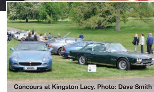
Concours at Kingston Lacy.

The Cameron Millar Spring Meeting was held this year in Dorset. Based at the Springfield Hotel near Wareham, the Club participants enjoyed perfect spring weather in which to enjoy the beautiful countryside of this lovely part of the country.