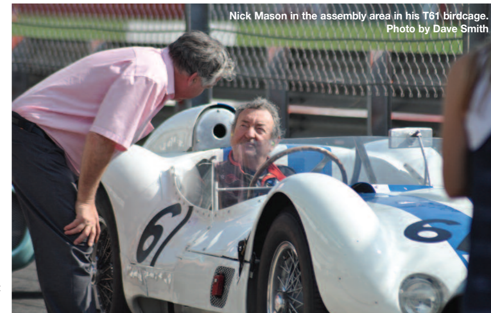
Nick Mason in the assembly area in his T61 birdcage.