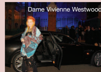
Dame Vivienne Westwood

In the exciting scenario of London Fashion Week, once again a fleet of Maseratis 'struck a pose' whilst chauffeuring celebrities to their favourite shows.