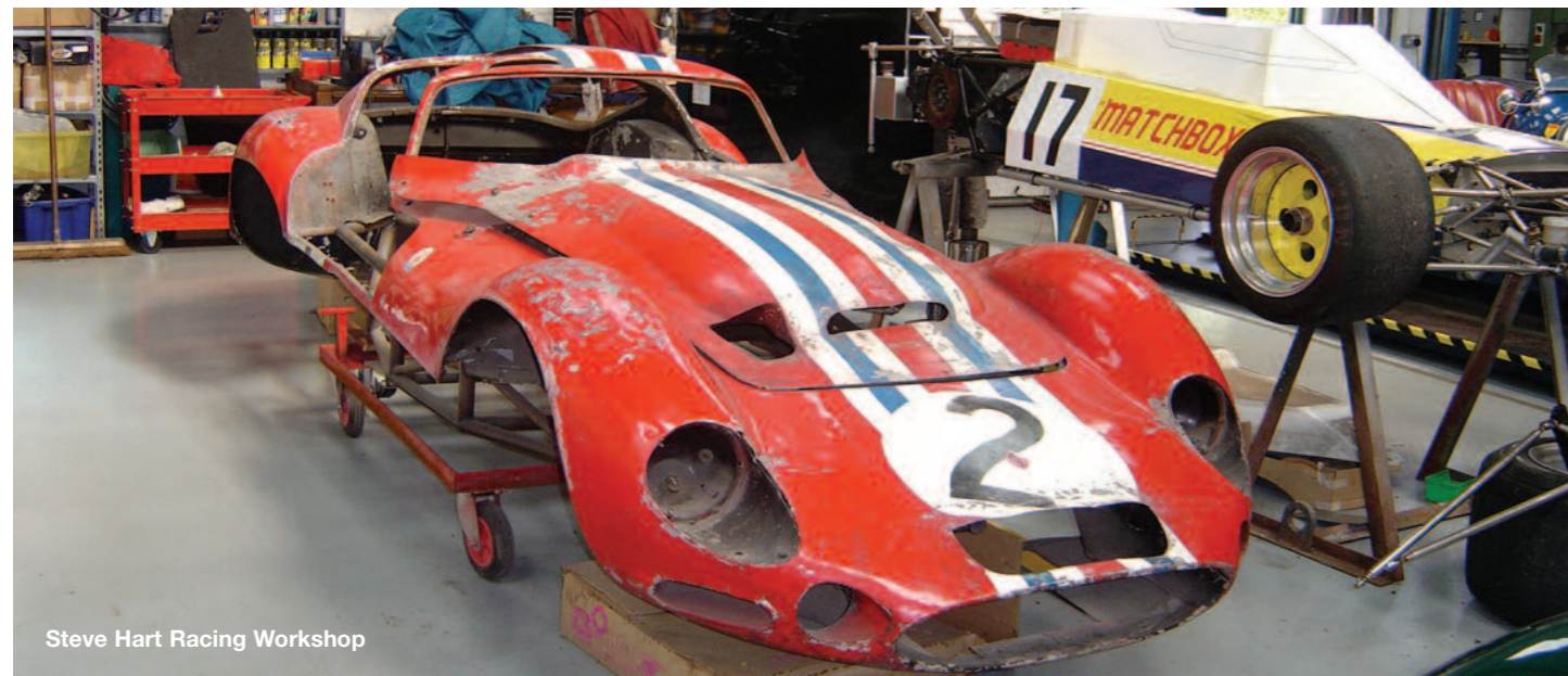
Steve Hart Racing Workshop

problem too and redesigned the casing for the 2.5 litre cars with extra stiffening ribs and making the casing from aluminium, instead of magnesium (as the aluminium is more forgiving than the magnesium cases). The difference in weight is about 6lbs. We are currently making a new casing for Marc Devis's similar car also, as he broke his diff case last year ... and his was the stronger type! So our initial plan is, when the car is back together, to give it a long and thorough test before embarking on a plan to go racing. We are pushing on with Barrie Baxter's Tipo 151/4. We are planning to have the chassis finished and painted to go back to the body shop so that the body can be finally fitted and finished. At that time, we will be looking to assemble the engine and transaxle. Radiators, plumbing and interior are still to do. Still a way to go, but the major parts will be ready soon. The engine, of course, is very similar to your Cooper Maserati, just a multi-plane crank instead of the flat plane type as in the CM, so therefore a different firing order, and the Lucas fuel injection system. No more news on the 151/1 just yet, though we hope to be moving on with it soon"