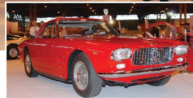
Steve Dowling's 5000GT

The Classic Motor Show, held last November, broke box office records when it welcomed around 48,000 visitors into its classic motoring extravaganza, an increase of around 8,000 visitors on the previous year's event.