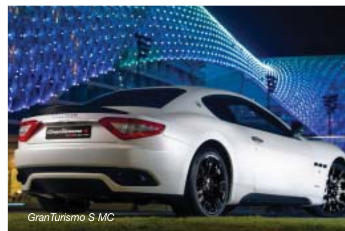
GranTurismo S MC

The limited-edition Maserati GranTurismo S MC Sport Line with Matt White 'ice' finishing was recently unveiled at the Yas Marina Circuit in Abu Dhabi. Only twelve GranTurismos in this configuration will be produced in Modena, all for the Middle East markets.