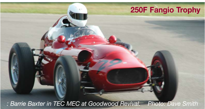
250F Fangio Trophy