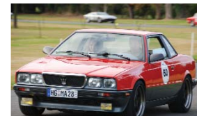
Hill section. Classic International 2009