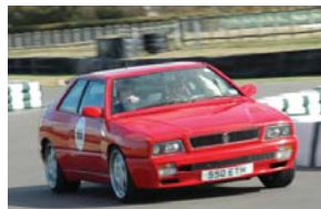
International Classic 2009

Copies and enlargements are available at attractive prices. Contact Dave on 01494 717701