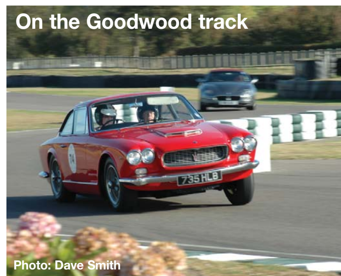
On the Goodwood track