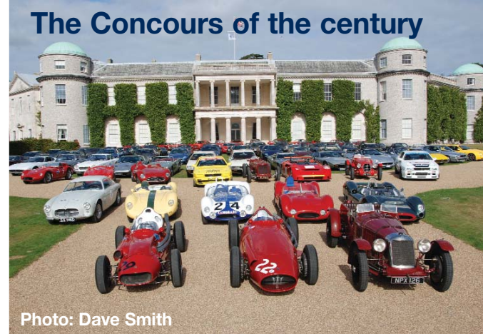
The Concours of the century